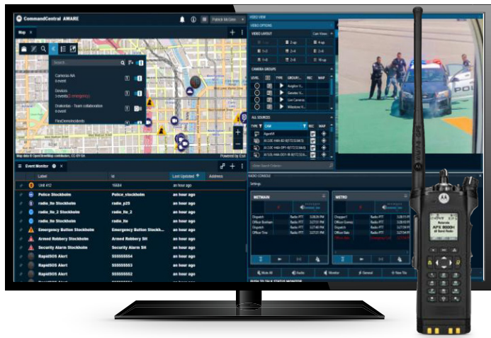
CommandCentral Aware Enterprise

Because enabling rapid response and documenting past incidents can be the key to preventing incidents from becoming tragedies