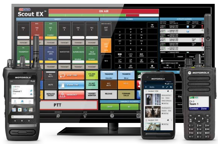
Avtec Scout Dispatch

Connectivity — across devices and networks — is an important part of ensuring you and your entire team are aware and informed at all times.