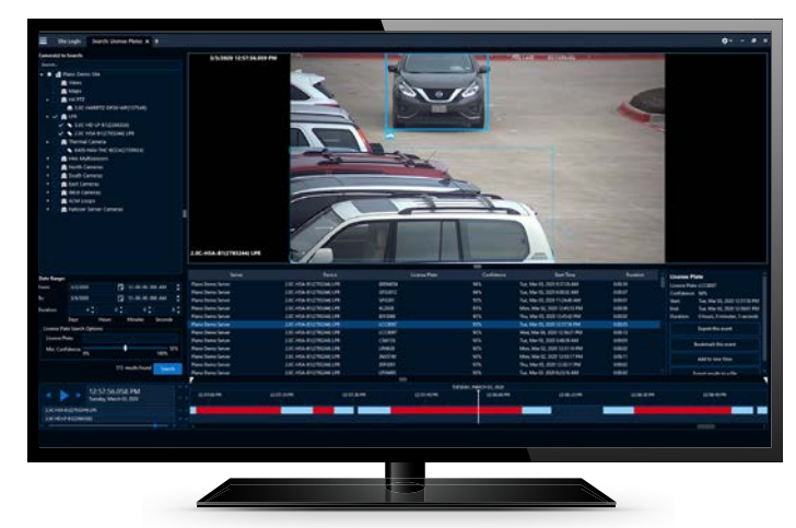
License Plate Recognition

All of this comes together to ensure you know what is happening with better insights to protect people, property and assets.